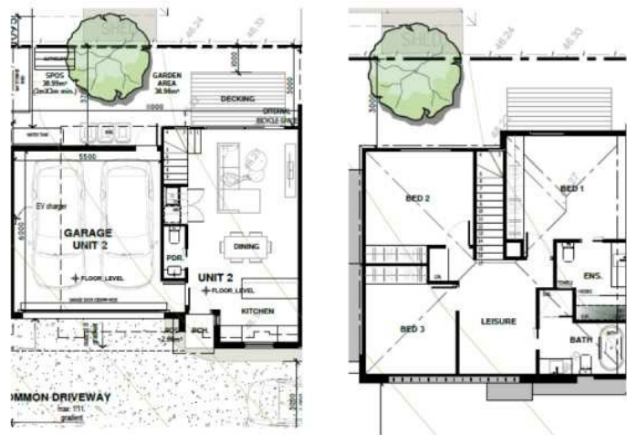
4B Cobar Street Bentleigh East