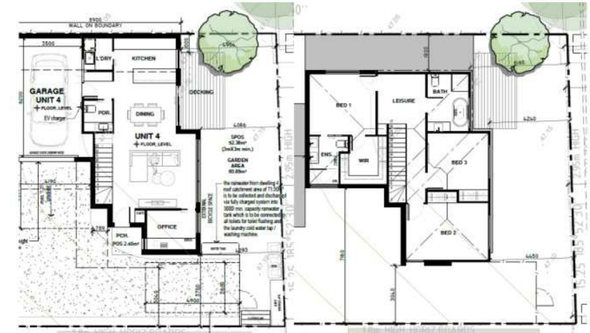
4D Cobar Street Bentleigh East