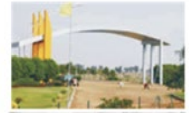
MEADOWS Ajmer Xpressway