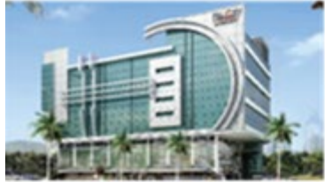
FELICITY TOWER Sahakar Marg