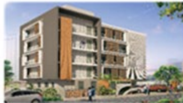
FELICITY AURA Vaishali Nagar