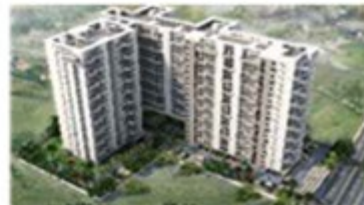
FELICITY AVENTURA Malviya Nagar