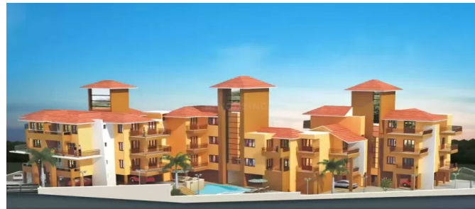
Felicity Riverview Park, Chimbel