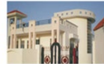
FARM HOUSE Ajmer Xpressway