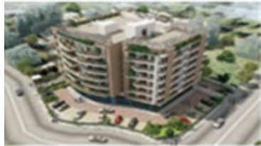
FELICITY SOLITAIRE Swage Farm