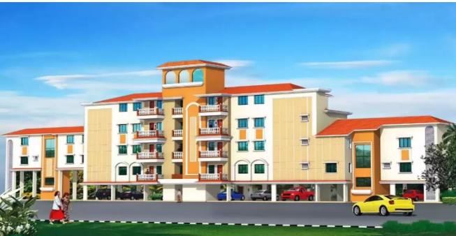
Felicity Sea View, Miramar