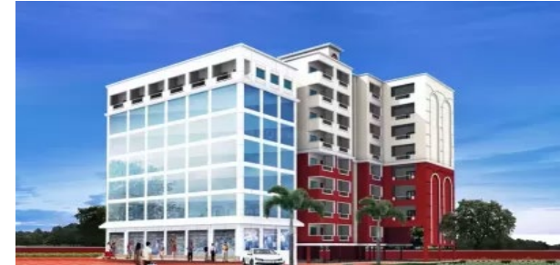
Felicity Port Tower, Vaddem