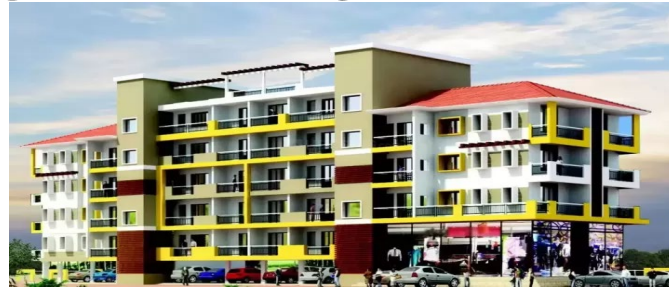
Felicity Apartments, Tiswadi