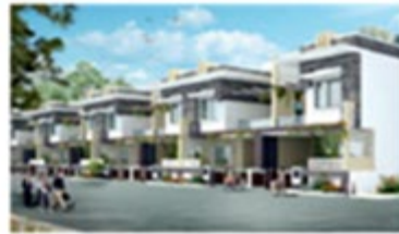
SELECTHOME Sirsi Road