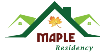
MAPLE RESIDENCY Chittora