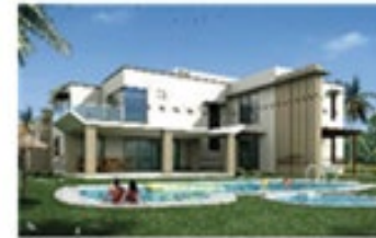
NATUREWOODS Sirsi Road,