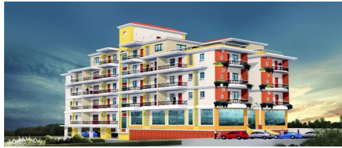
Felicity Airport Residency, Vaddem