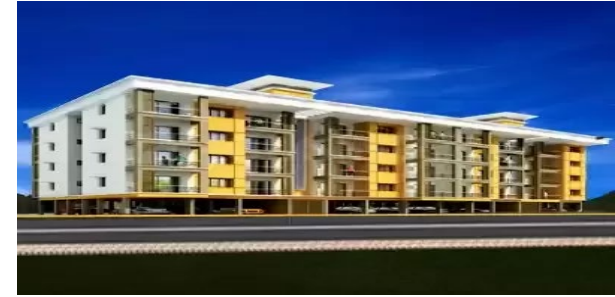
Felicity Hill Side, Mormugoa