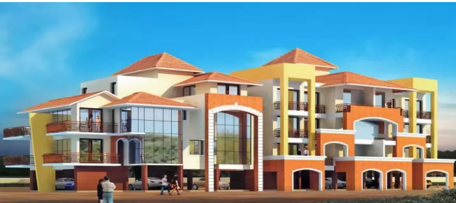
Felicity Elegance, Vaddem