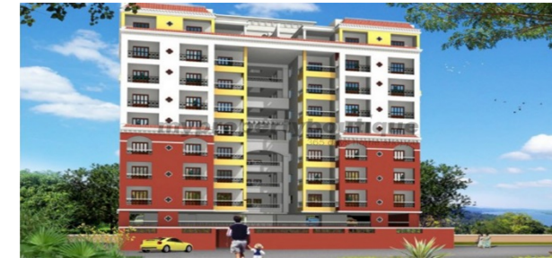
Felicity Riverview Residency, Chimbel